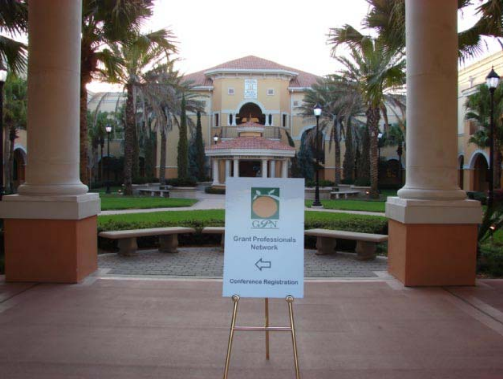
A perfect setting: The beautiful UCF Rosen College of Hospitality Management